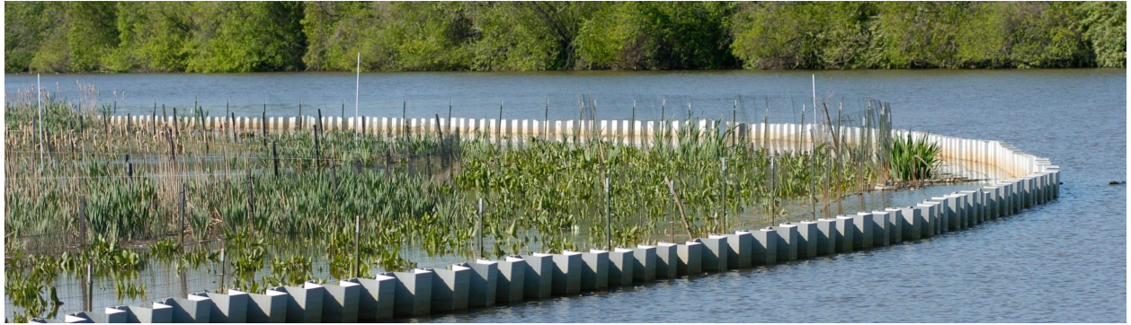
Constructed Wetland at the Benning Road Facility

We are committed to conducting operations at the Benning Road facility with respect and care for the environment. We are also committed to maintaining an ongoing dialogue with our neighbors. We want to hear their concerns and share with them information about the on-going environmental evaluation of the Benning Road facility and adjacent portion of the Anacostia River, known as a Remedial investigation/Feasibility Study or RI/FS. We are performing this RI/FS with the oversight of the District Department of Energy and the Environment (DOEE). We have completed the Remedial Investigation (RI) phase of the project. The findings of this investigation are presented in a Draft Final RI report, which was approved by DOEE and released for public review and comment on October 04, 2019. Here are answers to some of the questions you may have about the facility and the Draft Final RI Report.