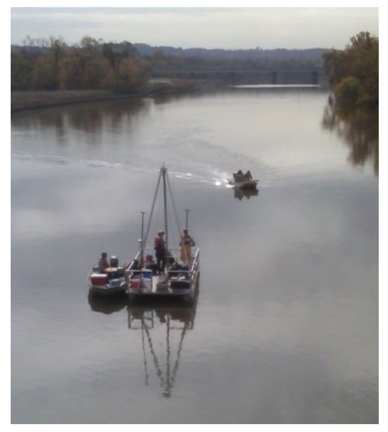
Boat-mounted drilling equipment was used to collect sediment samples from the bottom of the Anacostia River.

The RI work was conducted in accordance with a DOEEapproved RI/FS Work Plan and three addenda to the Work Plan. The RI field activities included extensive investigation of the Benning Road facility and an adjacent segment of the river, including the collection and testing of nearly 2,000 samples of soil and groundwater at the facility and surface water and sediments in the river. The sampling results have been extensively evaluated, including an assessment of the types and extent of contamination present at the Benning Road facility and in the river in comparison to background sources of contamination such as combined sewer overflows and urban runoff. The RI evaluations also included a baseline human health risk assessment (BHHRA) and a baseline ecological risk assessment (BERA) to assess the risks from exposure to the contamination detected in the environmental media. The results of this work are described in detail in the Draft Final RI Report. The report also contains 620 pages of tables and 76 pages of figures and charts summarizing the data collected, as well as 28 appendices containing supplemental evaluations and information, such as copies of the laboratory analytical data reports.